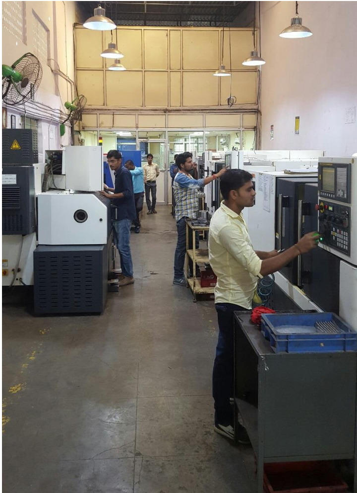
CNC Machines in Main Facility

Although some manually operated Lathes are still in use, most of the products are manufactured using one of 8 modern CNC Milling Machines. Items are usually produced in batches and production planning is controlled by the company's computerised system with input from the Production Manager. Overall I was impressed with the process and attention to detail by the workers.