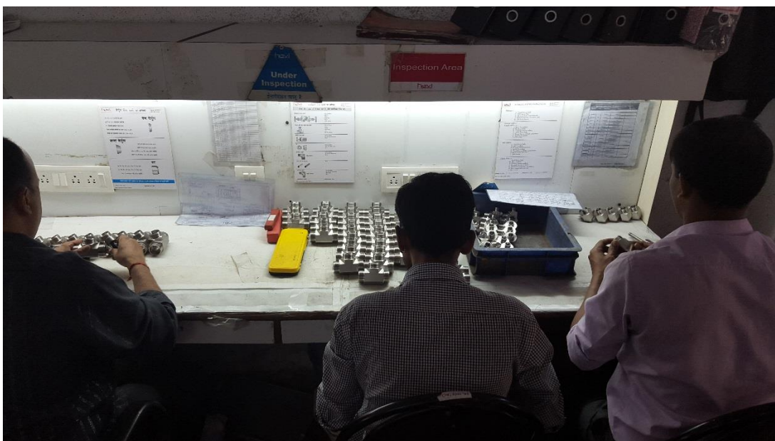
Final inspection to ensure exact compliance with specifications

HAVI Welcome any customers to visit their site at any time to view their testing and quality control processes.